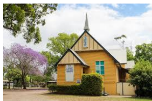
Sunnybank Theatre. Brisbane.

*Toilets outside, long iron staircase or hill. Unsuitable for unsteady walkers or dicky tickers.