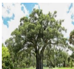
Giant Strangler Fig

The next trip is to Tamborine, which we probably know quite well. Can one tire of the endless beauty of the mountains?